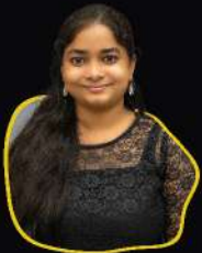
Sureka Content Writer